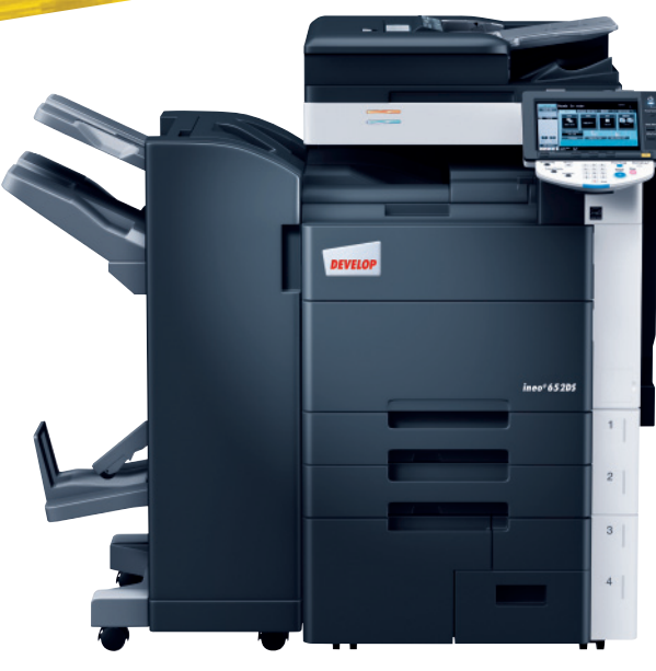
ineo<sup>+</sup> 652Ds with staple finisher (FS-527) and saddle kit (SD-509)